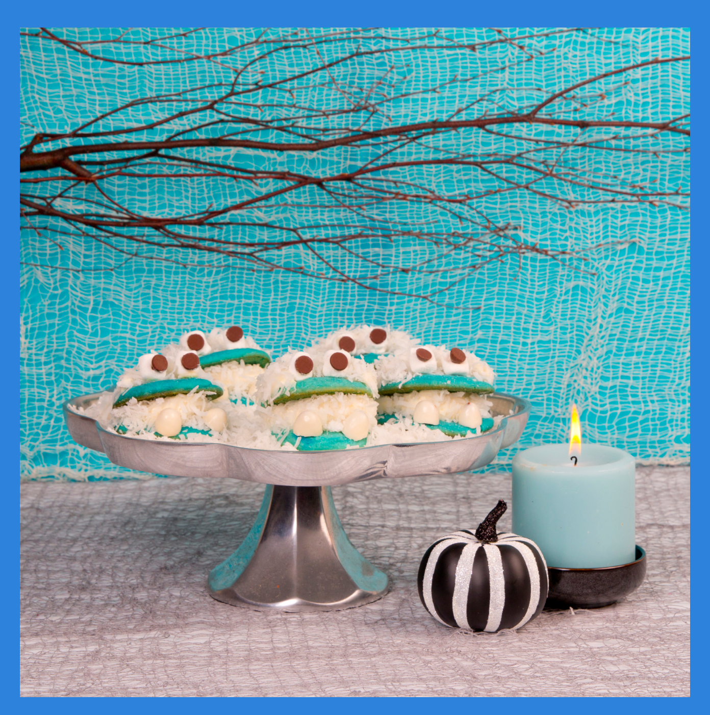
11. Quickly eat these Abominable Snowman Cookies before they disappear back into the #HalloweenHills ice!

10. The cookie sandwich should look like an abominable snowman popping out of the snow.