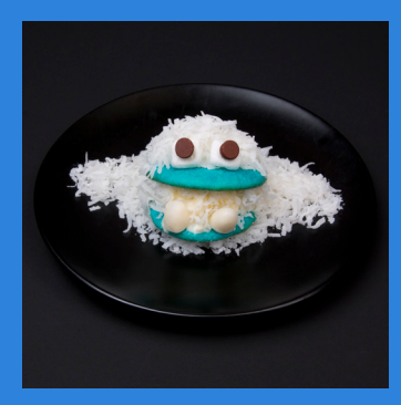
9. Sprinkle more coconut around the ice cream sandwich and on top, being careful not to get any in front of the eyes.