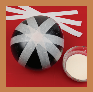
5. Let the excess paste drip off of the strip, then wrap it around the balloon. Repeat this until the balloon is completely covered except for a small circle at the bottom of the piñata.