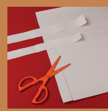
3. Cut up a bunch of newsprint into strips.