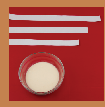
4. Mix one part flour and two parts water to make your paste. Dip the strips into the paste.