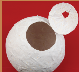
8. Cut a circle out at the bottom of the piñata, leaving a section connected to the piñata so that it hangs off. Remove the balloon and any paper mache dust inside the piñata.