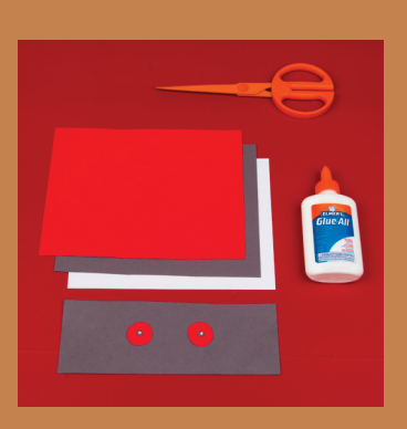
12. Cut a rectangle out of black construction paper, and glue on a pair of eyes.