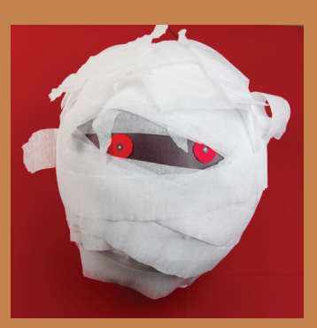
14. Glue the end of a white crepe paper streamer to the back of the piñata. Wrap the crepe paper around the piñata, gluing periodically. Only a part of the eyes should be left uncovered.