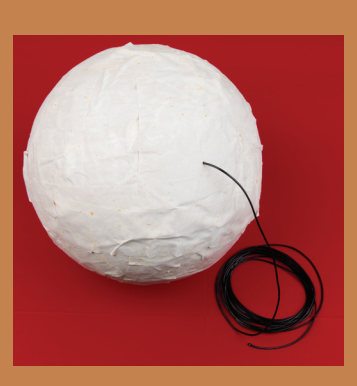
9. Pierce a small hole through the opposite end and thread a knotted string through.