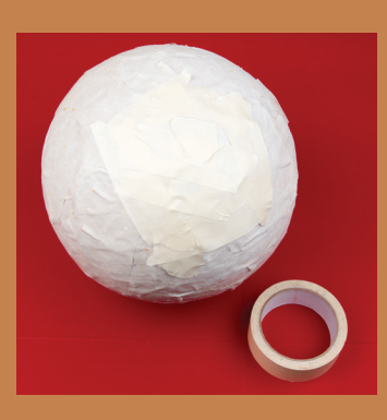
11. Tape the bottom closed.