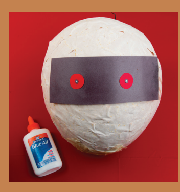
13. Glue the black rectangle to the piñata.