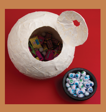
10. Fill the piñata with candy.