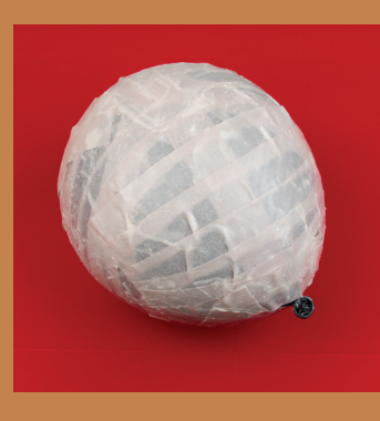
6. Allow time to dry before adding a second and third layer. Let the piñata dry overnight.