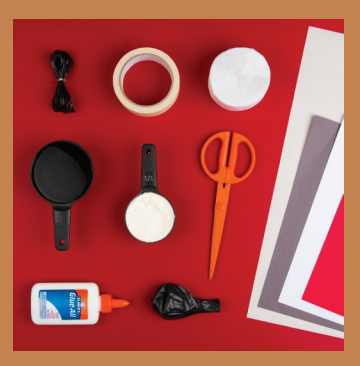
1. Gather your ingredients: string, tape, white crepe paper, water, flour, scissors, a black balloon, glue, newsprint and construction paper.