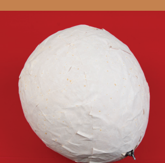
7. When the piñata has hardened completely, pop the balloon.